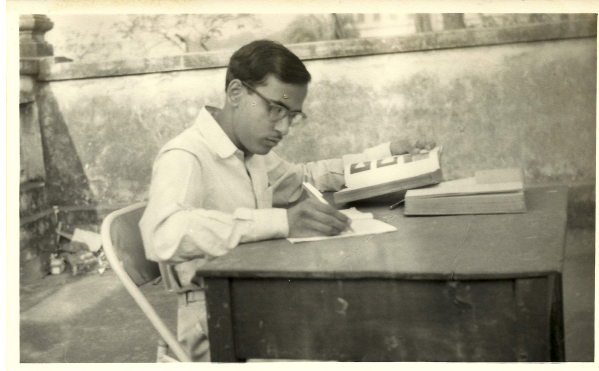
Figure 2: On the top floor of the Swarnamoyee P. G. Hostel, there were two rooms. One of them was allotted to me. I could study outside my room.