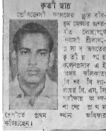
Figure 1: 1962 photo in Jugantor

(1968) of stay in IISc. I learnt an important lesson “ in order to teach some topics in mathematics and physics, we should always use some equations essential for understanding precisely ”. In my lectures to INSPIRE students of 11th and 12th standard, I convey the essence of STR by using some algebraic expressions.